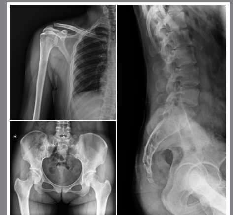
Images from a ALERIO Smart 4000 mobile x-ray